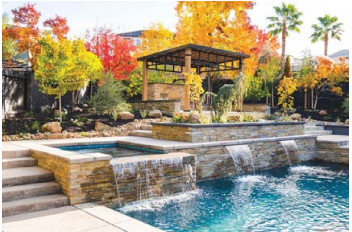
24th ANNUAL FOLSOM GARDEN TOUR

available on tour days, Saturday 10:45am-3pm and Sunday 10:45am-1pm at Garden No. 1, 255 Cascade Falls Dr., Folsom. Tickets are $25 for ages sixteen and over; under sixteen are free. Descriptions of the gardens are published in the tour ticket booklet which includes addresses, maps, a list of sponsors and recipients of educational grants.