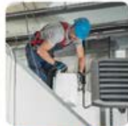
HEATING AND AIR