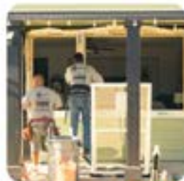
WINDOWS AND DOORS

California Energy Consultant Service 9380 Orangevale Ave., Orangevale CA, 95662 License No. 627677