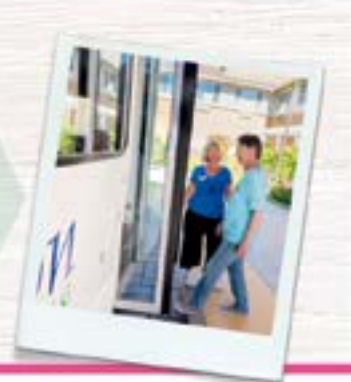
We make transportation easy. Bring your own car or sit back and let us do the driving.

We'd love to meet you! Visit our beautiful 7-acre campus today and see why our community is such a special place to call home.