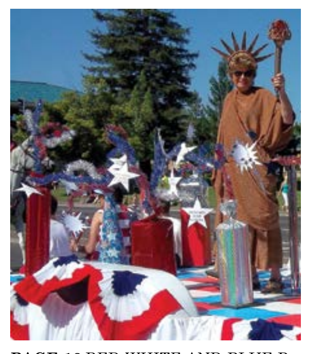
PAGE 18 RED WHITE AND BLUE Parade! It's a great way to celebrate our community and show your patriotic spirit!