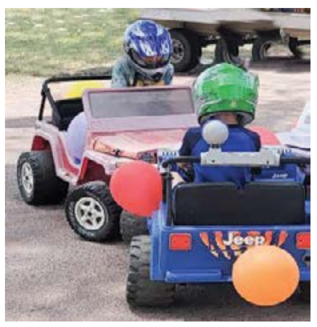
PAGE 13 Do you have a kid who loves to drive their power wheel around the neighborhood? Then you won't want to miss the KIDS POWER WHEEL DERBY