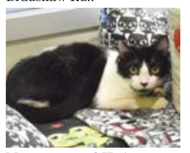
Marcos, animal ID A832143

Visit BradshawShelter.net to see all available catss and see who you fall in love with or visit the shelter at 3839 Bradshaw Rd.!"