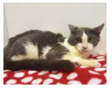
Apollo, animal ID A832143

SSPCA 6201 Florin-Perkins Rd Sacramento, CA 95828