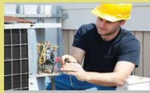
INSTALL AND REPAIR