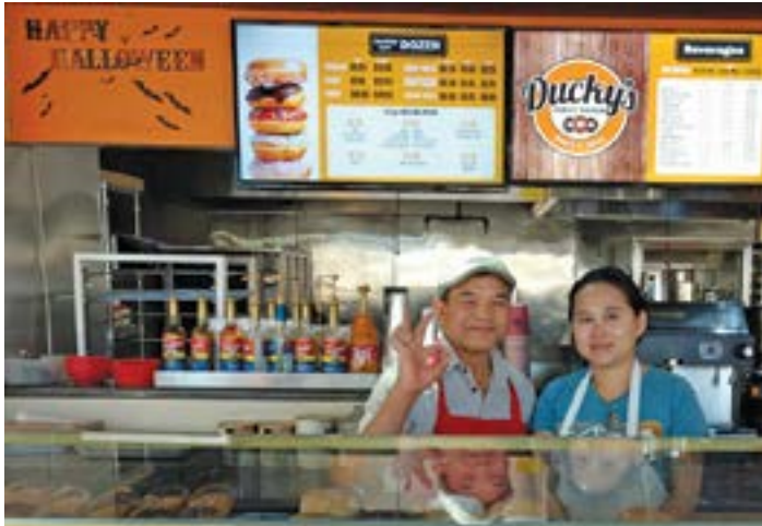
DUCKY'S DONUT SHACK -LOYAL 2 LOCAL PAGE 10