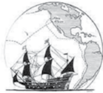
Drake Navigators Guild

The landmark, located within the boundaries of Point Reyes National Seashore at Drake's Cove, is the landing site and encampment of Francis Drake and his crew on their journey to California in 1579. While Drake voyaged on his circumnavigating expedition aboard the