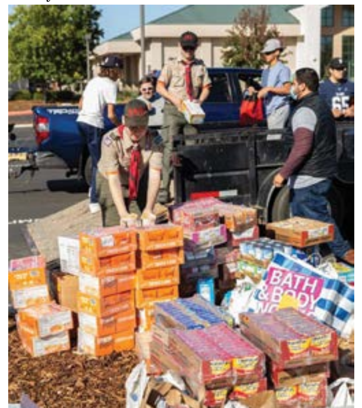
CONTINUED PAGE 2

This year's record breaking success was due to the collaboration of five churches, three football teams, an elementary school, three scout troops and a host of volunteers! The