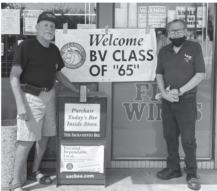
L&M Liquor and Deli were happy to serve the return of the Men's Bella Vista's Alumni High School Group from the class of 1965.

www.swensonlawfirm.com 8788 Greenback Lane, Suite 105, Orangevale, CA