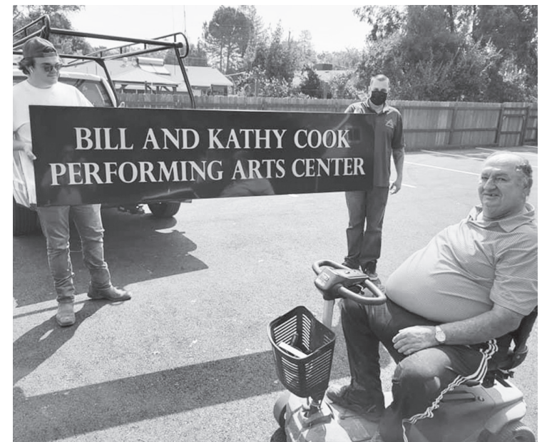
Kathy’s husband of 51 years by the new sign of the new performing arts center

While hearts are heavy from the tremendous loss to the community, comfort comes from the great legacy she leaves behind. After a recent band gathering paying trib-