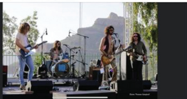
SPECIAL TOUR STOP IN ORANGEVALE American Mile ~ OV Summer Nights Concert ORANGEVALE GRANGE