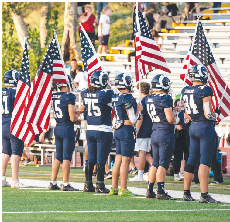
Submitted by M. Povey

Tuesday October 12th Argonaut vs Casa Roble 4:00 pm