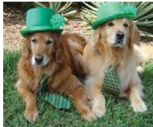
At the end of every rainbow is a pot of gold!

THE ROTARY CLUB OF FAIR OAKS AND THE GOLDEN RETRIEVER MEET-UP GROUP OF NORTHERN CA ANNOUNCES Golden delivery of over 450 handmade St. Patrick's Day Cards to Seniors of Fair Oaks