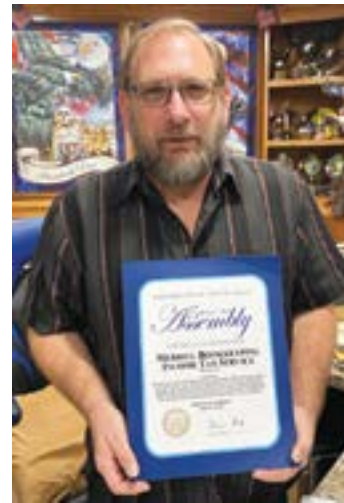
BEST ACCOUNTING OR TAX SERVICES - MERRILL BOOKKEEPING INCOME TAX SERVICE