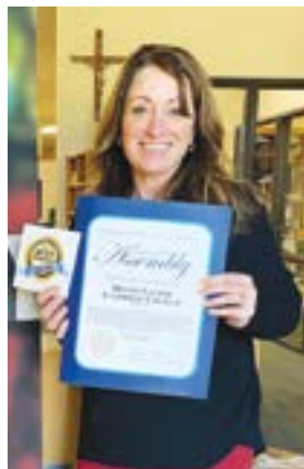
BEST CHURCH OR WORSHIP DIVINE SAVIOR CATHOLIC CHURCH