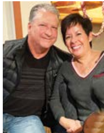
BEST COMMUNITY SPONSOR & BEST FAST-FOOD RESTAURANT DAIRY QUEEN GRILL & CHILL