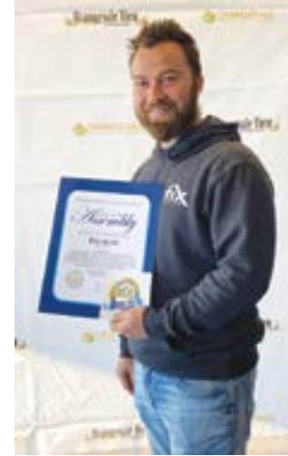
BEST AUTO BODY REPAIR FIX AUTO ORANGEVALE