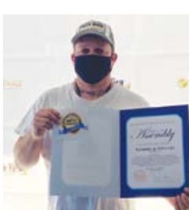
BEST CONTRACTOR - GENERAL SANDOVAL STUCCO