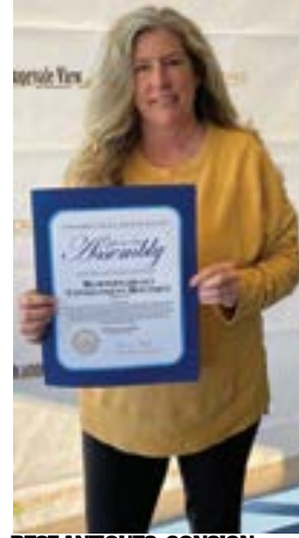
BEST ANTIQUES, CONSIGNMENT & THRIFT - BLOOMING DEALS CONSIGNMENT BOUTIQUE