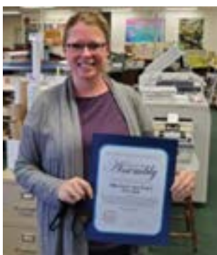
BEST BUSINESS SERVICES ORANGEVALE COPY CENTER