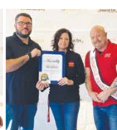
BEST GROCERY STORE GROCERY OUTLET BARGAIN MARKET