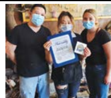
BEST LUNCH BLUE NAMI SUSHI & SAKE HOUSE