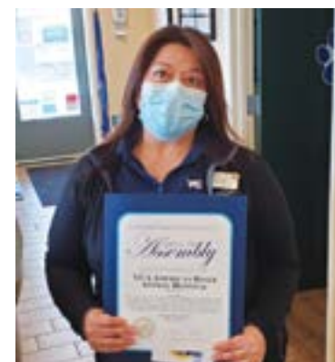
BEST VET OR VETERINARIAN HOSPITAL- VCA AMERICAN RIVER ANIMAL HOSPITAL