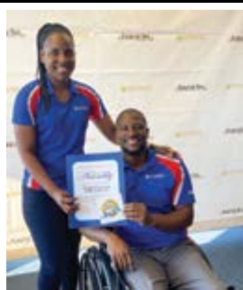
BEST HOUSE CLEANING SERVICE FAIREST CLEANING & RESTORATION