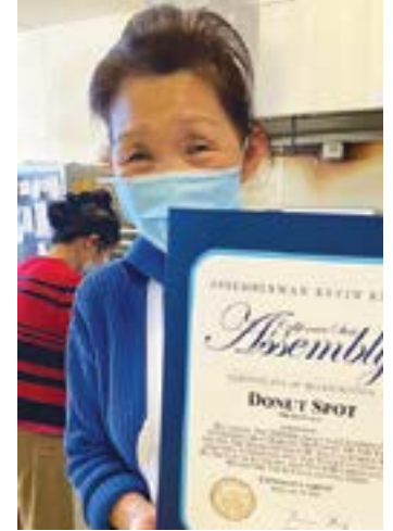
BEST BAKERY OR PASTRY DONUT SPOT