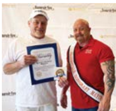
BEST PAINTING CONTRACTOR MCCOIN'S PAINTING SERVICES