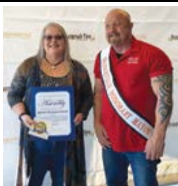
BEST HOME BUSINESS / DIRECT SALES- SHERI'S PAINTED GOODS