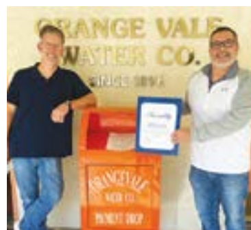
BEST PUBLIC UTILITY ORANGE VALE WATER CO.