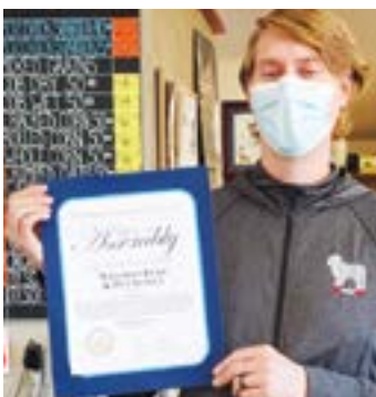
BEST PET GROOMING / SERVICES / STORE- WESTERN FEED & PET SUPPLY