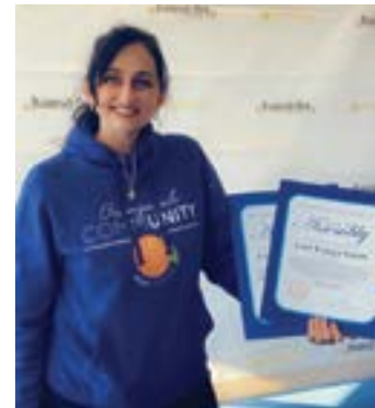
BEST BEAUTY OR SALON & BEST NAIL SALON LAST TANGLE SALON