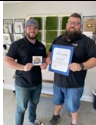
BEST LANDSCAPING SERVICE / DESIGN LANDSCAPES BY CO-CHRAN INC.