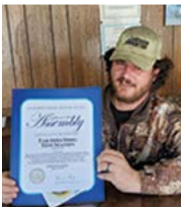
BEST SMOG SERVICES TAILPIPES SMOG TEST STATION