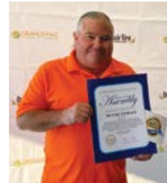
BEST STORAGE FACILITY SENTRY STORAGE