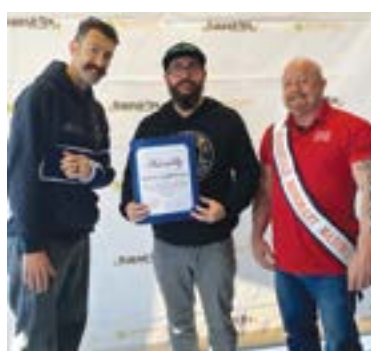
BEST SPECIALTY RETAIL SACRAMENTO SUP OUTLET