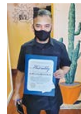
BEST DINNER LA PLACITA RESTAURANT