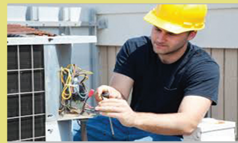
INSTALL AND REPAIR